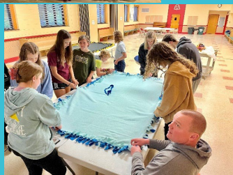
(top photo of graduates in prayer blankets, photo at right of youth who tied the blankets for the seniors)