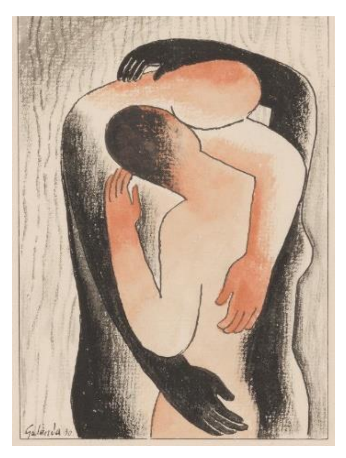
September 3, 2023